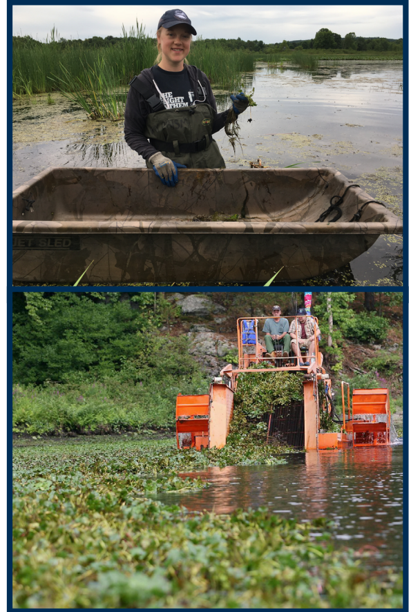
Photos Front: Top- water chestnut infestation; Middle- free-floating plants; Bottom (left to right)- mature nutlet, flower and bulbous bladders on leaf stems. Photos Back: Top- water chestnut manual removal; Bottom- mechanical removal.

USE PESTICIDES WISELY: Always read the entire pesticide label carefully and follow all instructions. Pesticide regulations can vary widely between regions; please contact local authorities for additional pesticide use requirements, restrictions or recommendations. Mention of pesticide products by WNY PRISM does not constitute endorsement of any material.