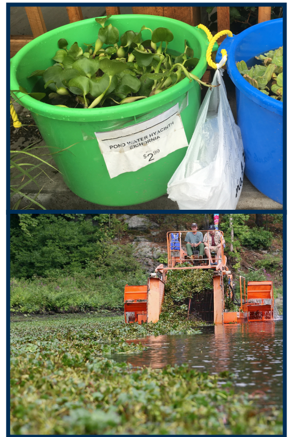
Photos Front: Top- water hyacinth flower; Middle- water hyacinth roots; Bottom (left to right)- water hyacinth leaf cross-section, water hyacinth closed flowers, water hyacinth.

USE PESTICIDES WISELY: Always read the entire pesticide label carefully and follow all instructions. Pesticide regulations can vary widely between regions; please contact local authorities for additional pesticide use requirements, restrictions or recommendations. Mention of pesticide products by WNY PRISM does not constitute endorsement of any material.