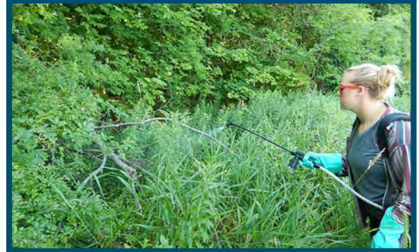
Photos Front: Top- common mullein; Middle- cutleaf teasel flowers; Bottom (left to right)- dame's rocket flowers, bull thistle flower, white sweet clover flowers.