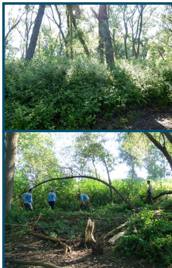
Photos Front: Top- Japanese barberry; Middle- common buckthorn berries and leaves; Bottom (left to right)- brushcutter, weed wrench, cut-stump herbicide treatment. Photos Back: Tiftt Nature Preserve restoration; Top- common buckthorn infestation pre-treatment; Bottom- mid-treatment, manual cut-stump treatments moving into the infestation.

USE PESTICIDES WISELY: Always read the entire pesticide label carefully and follow all instructions. Pesticide regulations can vary widely between regions; please contact local authorities for additional pesticide use requirements, restrictions or recommendations. Mention of pesticide products by WNY PRISM does not constitute endorsement of any material.