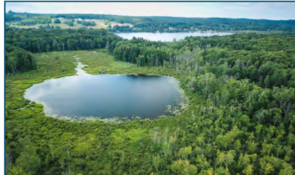
Aerial view of beautiful wetland habitat at Cassadaga Lakes Nature Park.

boat launching has damaged the existing riparian vegetation. Targeted removal of glossy buckthorn is an integral part of this restoration effort.