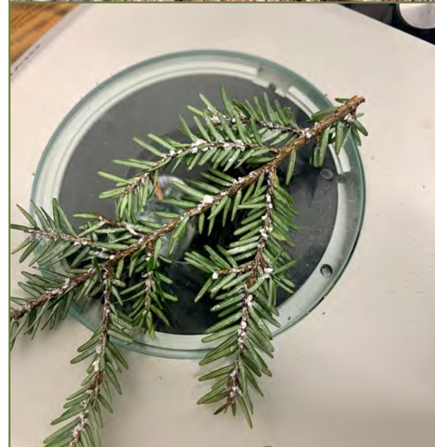
Josh Konovitz collecting HWA specimens for mortality analysis. Hemlock branches with HWA infestation were analyzed to count dead and alive HWA.