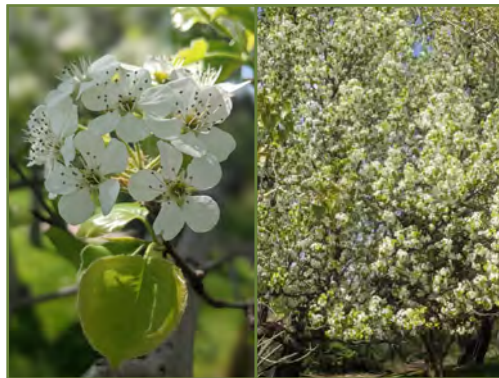
Individual cluster of flowers and mature trees in full bloom. Callery pear flowers in early spring and can grow up to 60 feet in height.

Callery pear grows in partial shade and full sun, loving roadsides, forest edges, fields and right of ways. It has branches that grow in steep, upright angles, giving the tree an overall raindrop shape. The leaves are arranged alternately, are about three inches wide, mostly rounded and have a finely toothed leaf margin. The five-petaled flowers are white with purple anthers. They grow in clusters and exude a pungent odor.