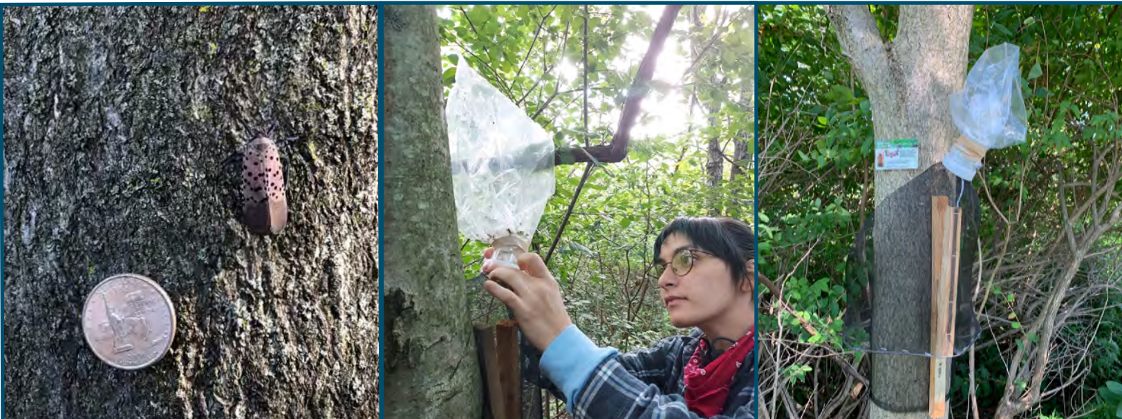
Photo Credit: iMapInvasives report #1294025, confirmed presence of spotted lanternfly in Buffalo.

The WNY PRISM mission is to proactively identify, evaluate and address invasive species priorities in western New York using a coordinated partnership of local professionals, organizations and private citizens to improve, restore and protect local aquatic and terrestrial resources.